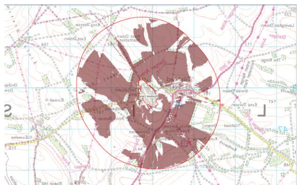
Right: Mortar assessment against Military Security Base